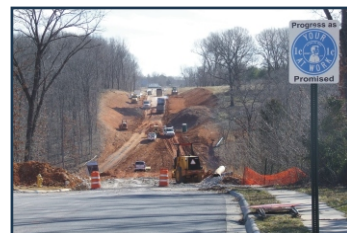
Extension of Tiger Boulevard

Fire. Bentonville is fortunate to have an enviable "Class 2" ISO fire rating. This rating is based on very strict criteria and benefits Bentonville property owners through lower insurance rates. The