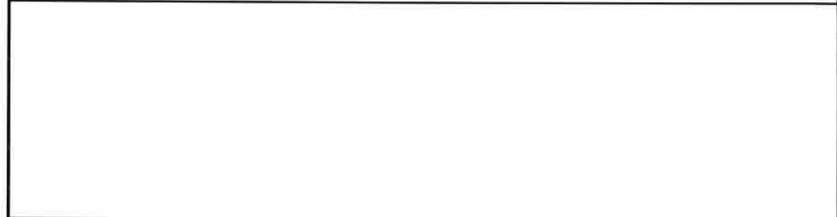
Illustration or Photo (Attach to Application If Necessary)

Phil Swope 6/18/2020 Applicant Signature Date