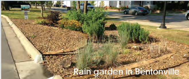
Rain garden in Bentonville

To function as designed, regular maintenance is necessary, which includes removing clogs caused by the accumulation of sediments and checking that plants are alive and healthy. Volunteer organizations