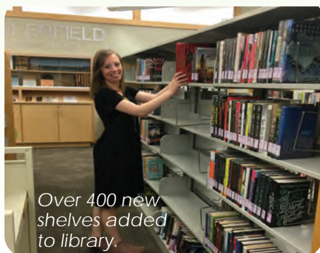
Over 400 new shelves added to library.

We are also aggressively implementing new and better ways to connect with the public. Some of the most common issues and concerns of citizens and their city revolve around traffic, code enforcement and city planning. It all gets better with the integration of technology and data. We are currently working behind the scenes to implement a Bentonville311 system that provides technological advances into a multi-channel service that connects the public with government, while also providing a wealth of data that improves how we seek to run the city. The expected launch date for this feature is September 1, 2019. In addition, recent implementation of the new TrakIt System in our Planning Department offers more efficient tracking