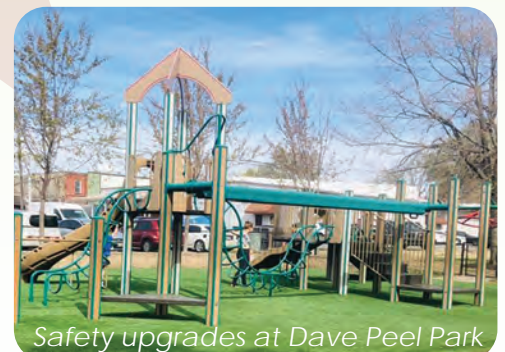
Safety upgrades at Dave Peel Park