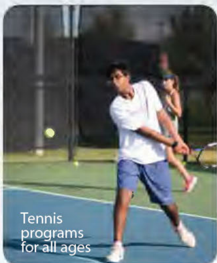
Tennis programs for all ages

Bentonville Parks and Recreation partners with Ozark Tennis Academy to teach our tennis programming in order to provide the highest quality service and professionalism around.