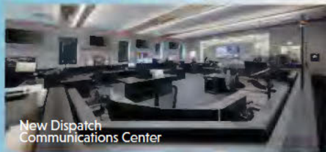
New Dispatch Communications Center