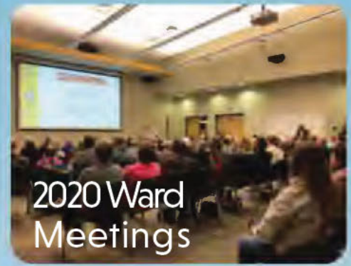
2020 Ward Meetings