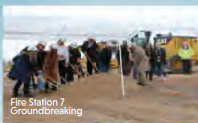
Fire Station 7 Groundbreaking