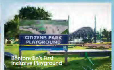
Bentonville's First Inclusive Playground