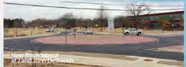
New Roundabout at J and John DeShields