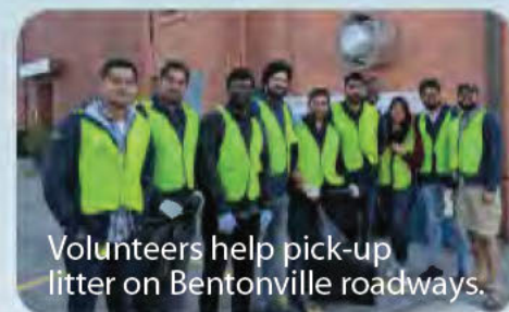
Volunteers help pick-up litter on Bentonville roadways.

www.bentonvillear.com/545/Volunteer-Program