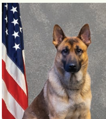
Bico Police K-9

Maverick, the goose dog, is our latest addition to the team. He works at the municipal airport to keep our local geese population safe from accidents with aircraft. Every dog has a special purpose and their skills are unmatched when it comes to keeping our officers and community safe!