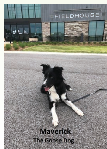
Maverick The Goose Dog