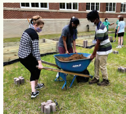
Teens work with Master Gardeners to build an outdoor learning lab.

SPONSORSHIP: The Friends of the Bentonville Library, in part by a grant from the U.S. Institute of Museum & Library Services to the Arkansas State Library under the provisions of the Library Services & Technology Act, and other generous donations to the Library.