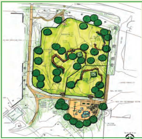
Dog park and playground planned for Orchards Park.