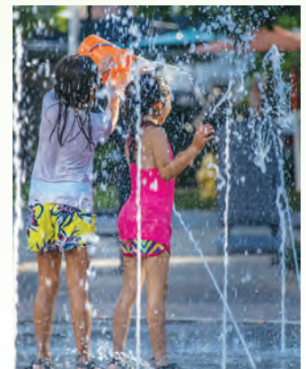
Aquatic facilities open for summer.

The hot, hazy, and humid days of summer have definitely arrived. Between the Melvin Ford Aquatic Center, Bentonville Community Center pools, and Lawrence Plaza Splash Park, Bentonville Parks and Recreation has several options to keep you cool and comfortable throughout the summer months. Above and beyond traditional water play, we host swim lessons, swim team, masters swim, camp opportunities and pool parties. Invest in a membership (family, individual, or youth) and get access to all our aquatic facilities to beat the heat poolside. For program information, hours of operation, and all-things aquatics, visit playbentonville.com .