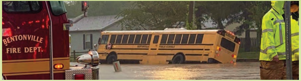
BFD assisted a school bus caught in flash flooding on April 28th.

Flooding is the most common and widespread of all natural disasters. It's important to know what to do before, during, and after a flood.