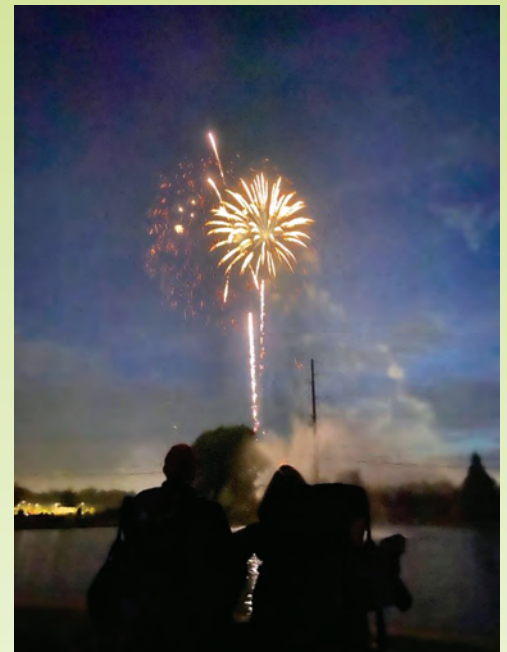
An Evening at Orchards Park scheduled for July 4th.