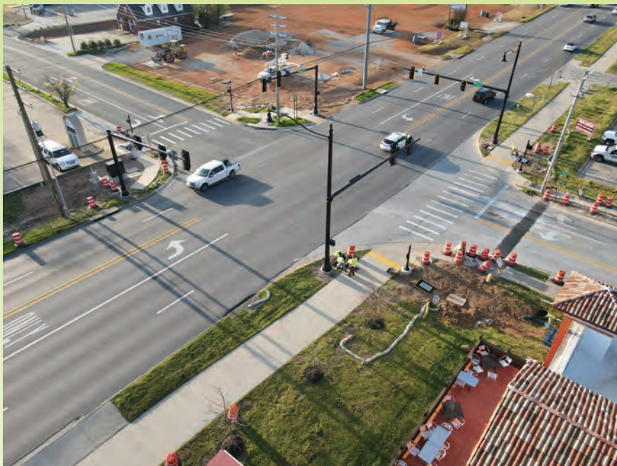
Recently completed project at NW 3rd St and N. Walton with new traffic signals and protected left turn movements for NW 3rd traffic. The city also completed an additional southbound lane on SW I St. at

Residents approved Street Improvement Bonds in the amount of $173.5 million to fund 32 specific projects. Details are available online at: www.bentonvillebond.com/streets .