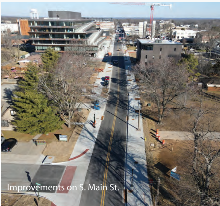
Improvements on S. Main St.

S Main St, SE 2nd to SE 8th: Project included narrowing road lanes and widening sidewalks.