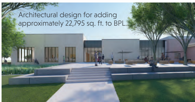
Architectural design for adding approximately 22,795 sq. ft. to BPL.

Want to support the Library's expansion project? The Bentonville Library Foundation is still fundraising! Online giving opportunities are available at bentonvillelibraryfoundation.org .