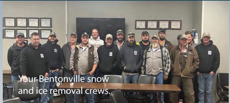
Your Bentonville snow and ice removal crews.

http://bentonville.com/DocumentCenter/View/581/Snow-and-Ice-Removal-Procedures-PDF .