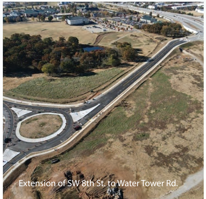
Extension of SW 8th St. to Water Tower Rd.