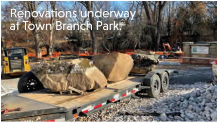
Renovations underway at Town Branch Park.

479-464-PARK (7275) • playbentonville.com