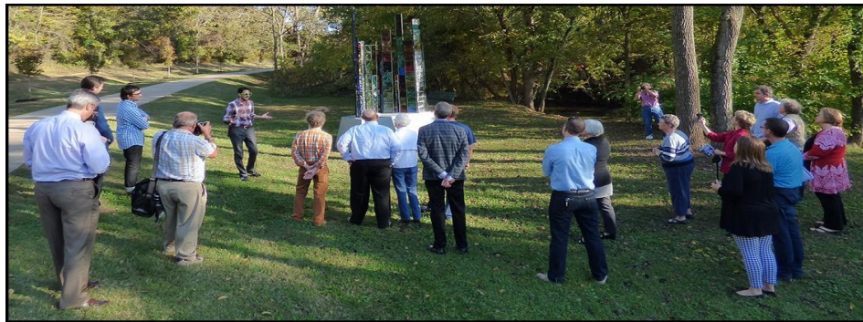
Public/private art can provide a focal point for community involvement. Here a member of the PAAC is describing a one of its projects..