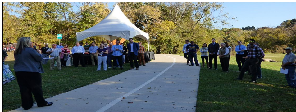
Public art projects garner interest from local business leaders, media, and community supporters. A group of 75 people attended the unveiling of one of Bentonville's PAAC projects. Local media covered the event.