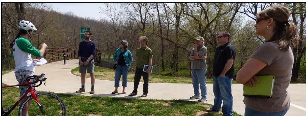
The PAAC leading a site visit for artists considering responding to a request for proposal for a public art project.

Art should be an important element of a private development project. These model the same principles of a public art project. The closer that connections can be made between public and private art projects, the more powerful the impact can be. A public/private artwork can have greater impact if its design takes into account the site, its history, the traffic, the surrounding environment, and the characteristics of its setting.